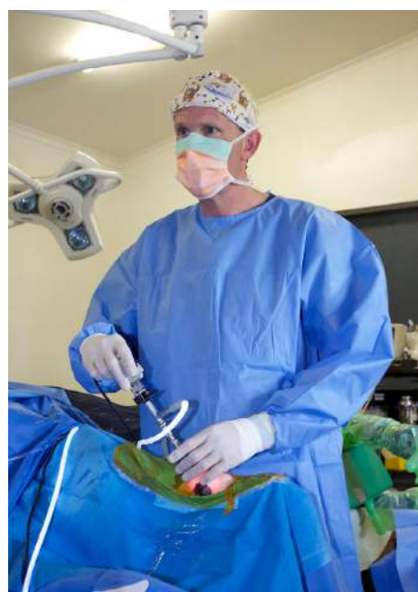
Tias performing arthroscopic surgery at the GCEC recently