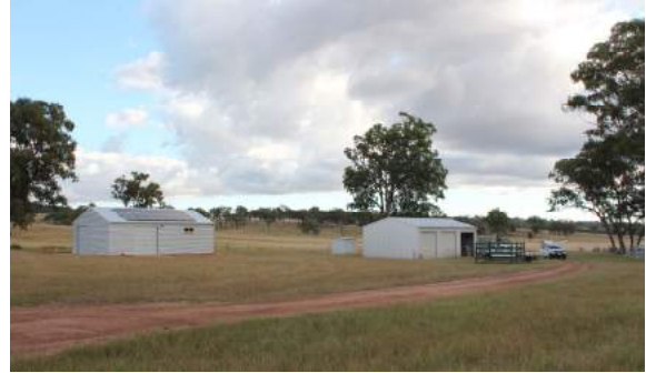
From little things big things grow. The modest first steps of the new clinic

good hospital base to treat these cases is essential to fulfilling this goal.